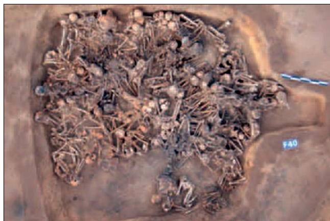
Fig 1. Ancient mass grave in China.

Eight of the 15 temperate diseases possibly reached humans from domestic animals, three from apes or rodents, the remaining four still of unknown origin. Eighteen of the 25 major human pathogens originated in the Old World and possibly one-third of all emerging diseases have originated from changes in land use thereby increasing animal-human interaction.