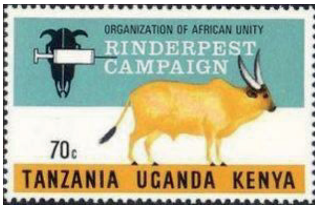
Fig 7. Rinderpest campaign stamp. Only the second global viral disease to have been eradicated.

Sylvatic plague arrived in North America around 1900 on ships from Europe carrying rats. Entire colonies of prairie dogs have been destroyed and 90% of black-footed ferrets, predators of prairie dogs, have subsequently been lost. Transmission to humans occasionally occurs, particularly among hunters. 23