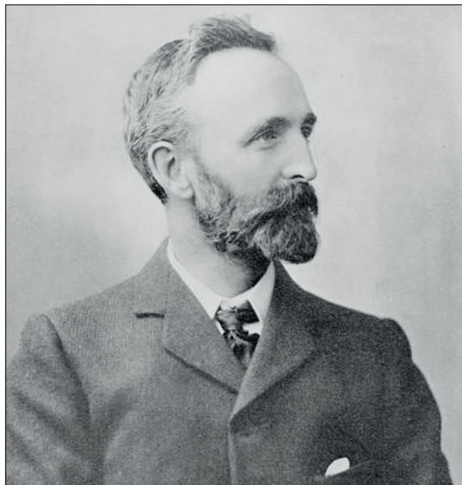
Fig 5. Sir Arthur Newsholme. Local Government Board Physician during the 1917-1918 Influenza pandemic

Sir Arthur Newsholme, 11 (Fig 5) a Local Government Board physician, advised people to stay at home if they were sick and to avoid large gatherings during the 1917-1918 influenza pandemic. Unfortunately, his advice was not published by the Government of the day. He argued that many lives could have been saved if his suggestions were followed. There were no imposed lockdowns until it was too late and the