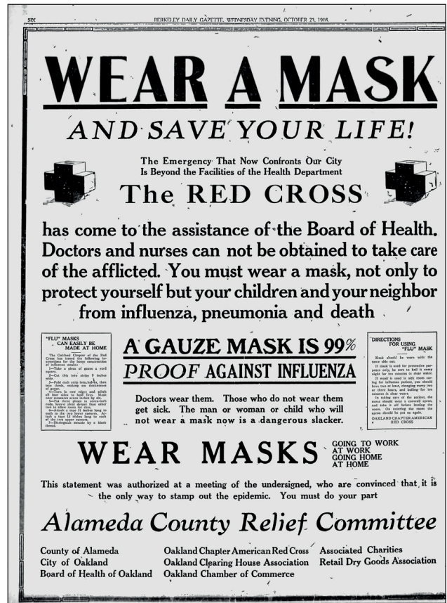
Fig 6. Page appearing in Time magazine encouraging the wearing of masks during the influenza pandemic.

The Black Death ended population growth with one-third to a half of the population of Europe dying. The relationship between land-owning lords and the peasants working their land deteriorated significantly. Workforce reduction occurred owing to high levels of mortality resulting in demands for higher wages and greater competitive marketing particularly trading in wool, textiles and silk resulting, paradoxically, in increased economic welfare of the surviving population. Little coordination of sanitary efforts occurred, medical efforts failed since the profession was unprepared for such