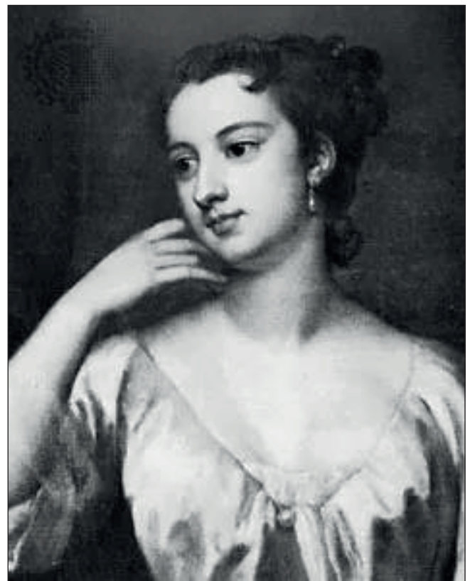
Fig 4. Lady Mary Wortley Montagu. Thought to have imported variolation into England in 1721.

In the 18th century isolation and quarantine became more common across Europe especially in sea ports around the Mediterranean. Lady Mary Montagu, (Fig 4), having recovered from smallpox in 1715, reported on the use of