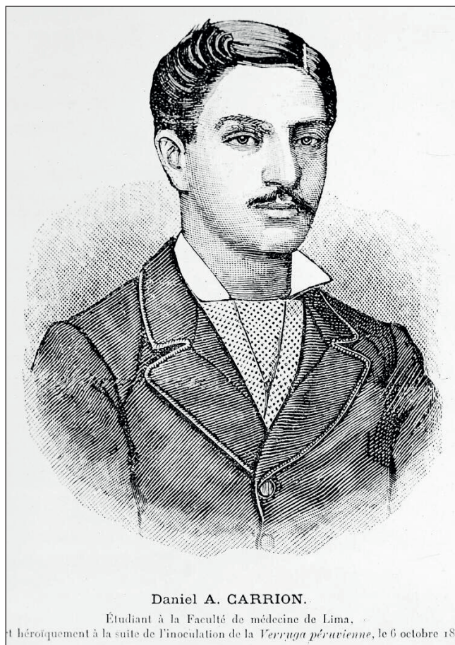
Fig 2. Daniel Carrion

Carrion's disease occurs in Peru and was studied by Daniel Carrion (Fig 2) who was appalled by the death rate (over 10,000 deaths between 1870 and 1871). He observed that verruga peruana and Oroya fever were transmitted by