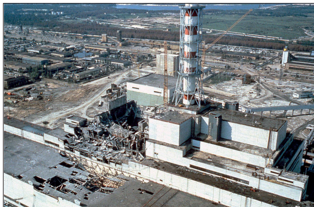
Fig 8. The destroyed reactor at the Chernobyl nuclear plant.

The Three Mile Island nuclear power plant in Pennsylvania, USA suffered a partial reactor meltdown in 1979 due to mechanical and human error involving the cooling system. Radioactive gases were released including iodine-131 leading to the mass evacuation of 200,000 people. Similarly, in 1986 in Chernobyl, Ukraine a powerful explosion in the nuclear reactor occurred followed by a core fire and second