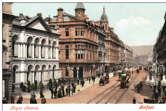
Figure 4: The Grand Central Hotel (first spire from the right). It was originally intended as a 'Grand Central Station' with underground platforms, 45 but the City Council opted for a new City Hall instead

In April the BB published 3 its first and only Bulletin ,