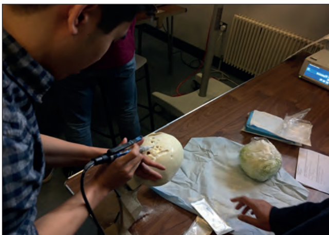
Figure 2 - Medical students demonstrating neurosurgical skill

Previously, an evaluation of the contribution of attendance at operating theatres in medical undergraduate neuroscience teaching at QUB, proposed a need to explore medical student perceptions of clinical neuroscience teaching 13 . Our practical events complemented traditional theatre-based learning, by allowing students to perform basic neurosurgical procedures. This year we collaborated with ‘Scrubs’, a student surgical skills society, and ran a full-day surgical skills conference for medical students. The neurosurgery section was run by Mr Tom Flannery and “Tekno Surgical”. The Neurology and Neurosurgery Special Interest Group (NANSIG) sponsored this event and provided the neurosurgical equipment. This allowed 40 students to perform burr holes, craniectomies, micro-suturing, dural closures and the insertion of pedicle screws (See figure 2). This provided tangible experience with surgical tools and a unique opportunity to consolidate neuroanatomical knowledge. We hope events like these