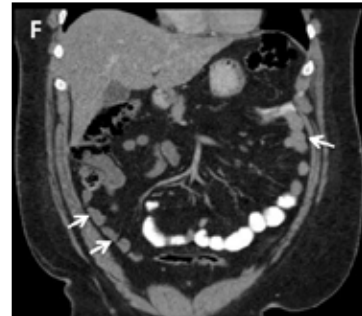
(F) CT scan of the abdomen was unremarkable.