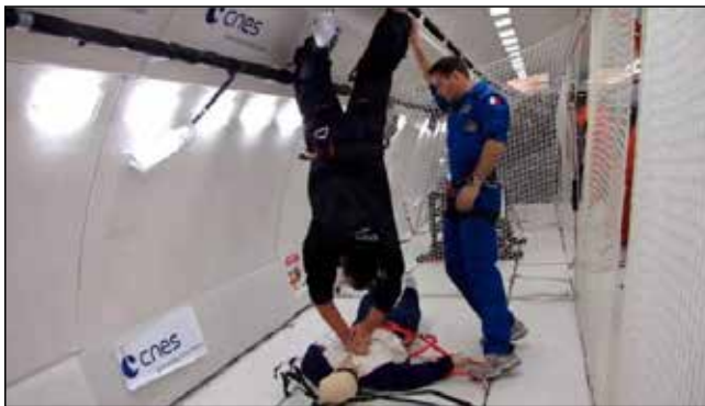
Using a wall for stabilisation.