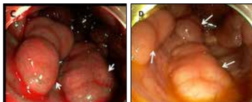
(C, D): Mucosa showed normal pit pattern on white light and narrow band imaging.