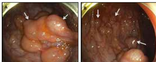
(A, B): Repeat colonoscopy at our centre confirmed the “clustered polypoid” lesions.

A 23 year old healthy male presented with intermittent bright red bleeding per rectum and non-specific colicky abdominal pain for over a year. There was no family history of colon cancer, familial polyposis syndrome or inflammatory bowel disease. On examination, he was overweight with normal vital signs. Physical examination was unremarkable as were his laboratory tests including inflammatory indices and complete blood count. An abdominal x-ray, CT scan and oesophago-gastro-duodenoscopy performed at an outside facility were normal, while colonoscopy revealed the colon to be matted with “polyps” in addition to internal haemorrhoids. He was referred for polypectomy or colectomy given the extensive nature of the disease.