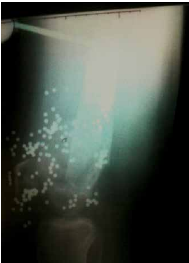
Fig 1. X-ray appearance of a shotgun wound to the leg.

The study population totalled one more victim than recorded in the 10 months preceding the 1994 ceasefire and 4 more than immediately post the 1994 ceasefire (Figure 3).