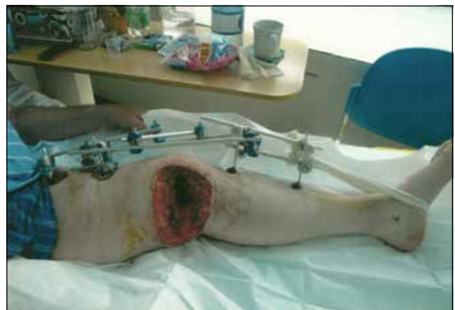
Fig 2. In-patient management of the same patient.

Adjusting for Bank of England inflation the present day total