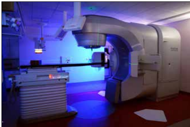
Fig 1. A linear accelerator for EBRT