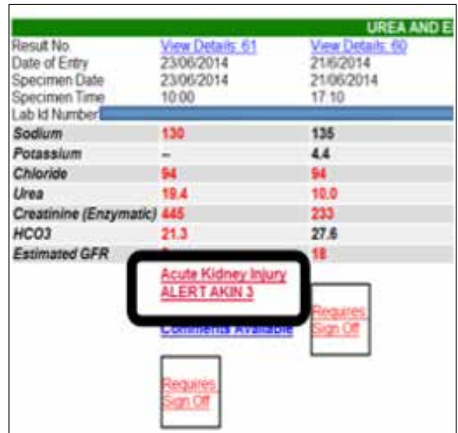
Fig 2. Example of AKI E-Alert

and will identify patients with Stages 1 -3 AKI, based on change in serum creatinine, and create an E-Alert (Figure 2). This E-Alert will be highlighted on the results reporting systems and patient management systems (Northern Ireland Electronic Care Record) with a link to the Guidelines and