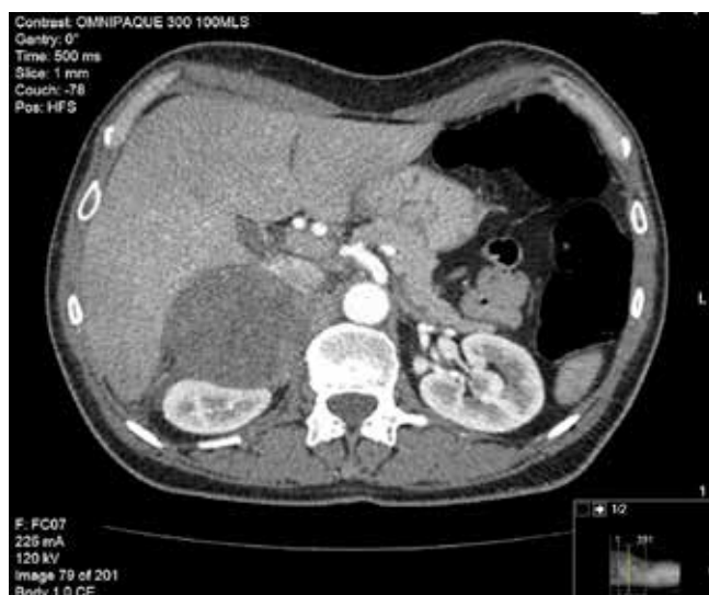
Fig 1a. Axial Abdominal CT scan showing large right sided adrenal mass.

The patient was transferred to a Regional Specialty Endocrine Surgery centre where hormone studies were performed