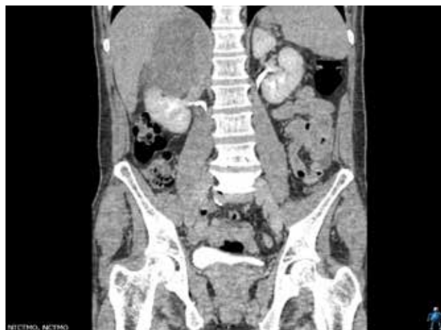
Fig 1b. Coronal Abdominal CT scan showing large right sided adrenal mass.

carcinosarcoma (ASC) is a rare subgroup of ACC. To our knowledge, only eleven cases have been previously reported in the literature. 8-17 We present the twelfth case and review the previous published literature to identify management strategies for the treatment of this rare tumour subtype.