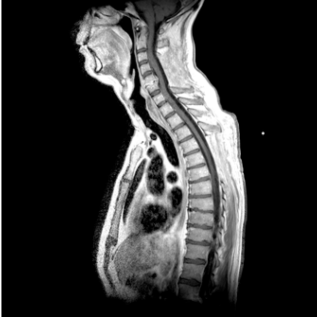
Fig 3. Sagittal T1-weighted scan of cervical and dorsolumbar spine after intravenous Gadolinium, three days following surgery. There has been resolution of the epidural abscess in the cervical and upper dorsal spine, with reduction in its extent in the lower dorsal and lumbar spine. Note enhancement of C5/6 intervertebral disc.

typical of spinal abscess and was not fulfilling the triad of this pathology, the high degree of suspicion and abnormal laboratory findings were the initial findings leading to this diagnosis. Our patient was started on empirical IV antibiotics after obtaining relevant samples for septic screen. We feel the underlying sticky platelet syndrome was not contributing to his pathology and the recent manipulation by physiotherapist could have been a predisposing factor as per literature.