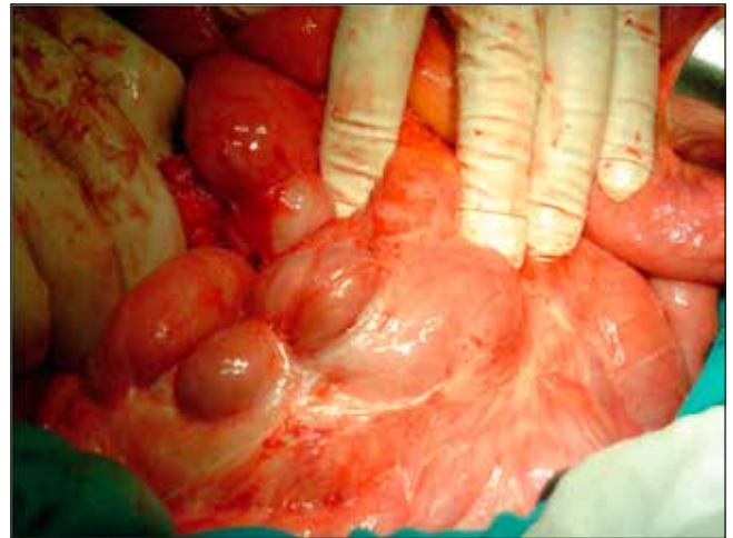
Fig 3. Intra-operative image demonstrating fibrous tissue constricting viscera, typical of EPS.

who required an ileocaecal resection. Two patients required ileostomies. Figures 3 and 4 demonstrate intra-operative findings of fibrous tissue constricting viscera, and the classical "abdominal cocoon" respectively. Table 2 shows the pathological findings. Patient 2 underwent an ileocaecal resection where pathological resection of the small bowel showed features of both radiation enteritis and EPS.