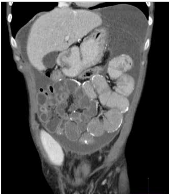
Fig 2. Coronal reformatted image from a CT scan of abdomen demonstrating a 'clump' of dilated central small bowel loops with serosal / peritoneal calcification in a patient with encapsulating peritoneal sclerosis. There is also a significant quantity of ascites.

Of the seven patients, five underwent surgery, with two patients managed conservatively. Of the five who did progress to definitive surgery, two were initially treated conservatively, with one patient receiving Tamoxifen and Prednisolone, and the second patient receiving Tamoxifen, Prednisolone, and Azathioprine, used to suppress peritonitis. Surgical management was complex and lengthy in duration - median 'skin-to-skin' time was 243 minutes (range 221-439 minutes), with an additional median of 61 minutes (range 32-63 minutes) for anaesthetic set-up time. Bowel conserving surgery (laparotomy, division of adhesions, excision of membrane) was performed except for one patient