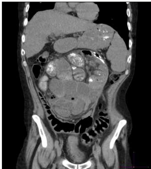
Fig 1. Coronal reformatted image from a CT scan of abdomen demonstrating dilated small bowel loops surrounded by a thin membrane in the central abdomen in keeping with encapsulating peritoneal sclerosis.

Features consistent with EPS were found in the 5 patients who underwent surgery, confirming the diagnosis, as demonstrated in Table 2 .