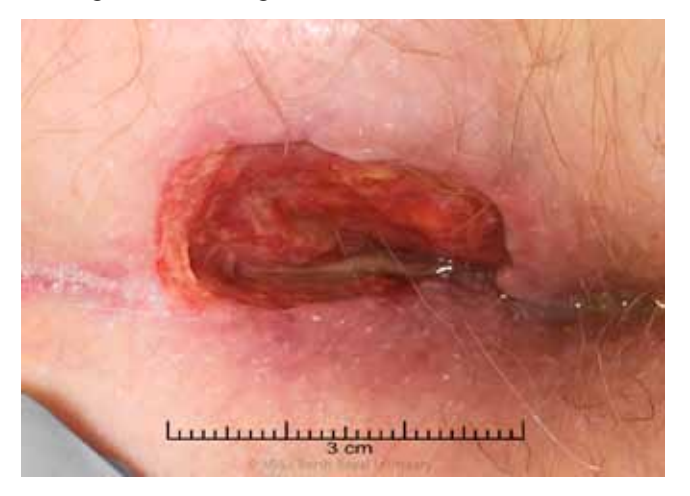
Fig 1. Ulcer at presentation.

Biopsies performed by the referring specialty had excluded malignancy and inflammatory bowel disease. On initial review by Plastic Surgery he was found to have a deep 3x1cm area of ulceration adjacent to his anus, which was sloughy and had well circumscribed margins (Figure 1). Microbiological investigations were negative.