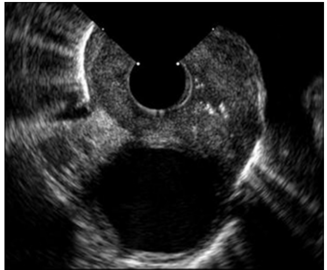
Fig 4. T4 lesion T4 lesion, with mass seen to invade aortic wall (hypoechoic aorta seen at 6 o'clock, normal five layered oesophageal wall replaced by mass)